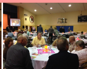
249 Guests attended the Beloit Banquet on April 24.