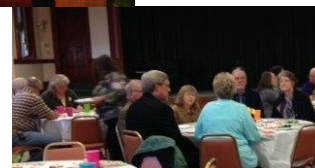
Right—Concordia banquet attendees await the beginning of the Concordia Banquet May 1