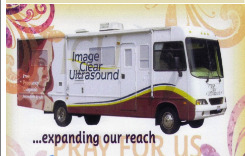
IMAGE CLEAR ULTRASOUND MOBILE UNIT

We are excited to announce the Image Clear Ultrasound Mobile Unit will be available TWICE a month, on the 1st and 3rd Tuesdays in Concordia.